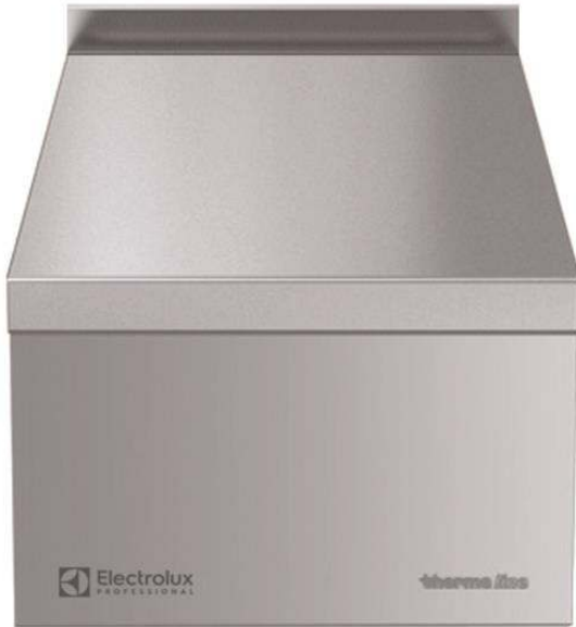
588563 (MBNABDDOOO) Closed Work Top, one-side operated with backsplash